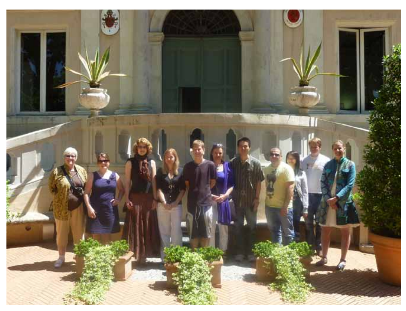
PATHWAYS 5th workshop at the Villa Lante, Rome in May 2011